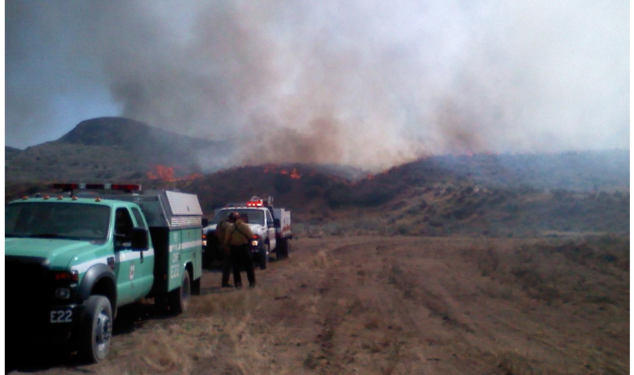
RLFR engine and a USFS engine operate on a wildland fire near Silesia.