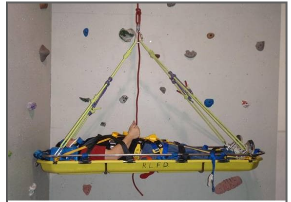
High angle rescue training using the new indoor training facility in the RLFR station on October 27th.

January will be here before you know it. Do you know where you sit on service hours? Check the bulletin board in the training room. Remember, you need 360 hrs per year!