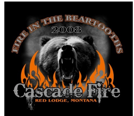
Cascade Fire t-shirts are in stock in the fire supply room and are available for sale at $10 each.